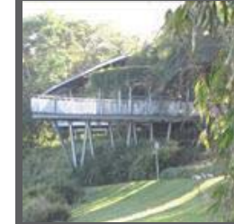
Mackay Regional Botanic Gardens