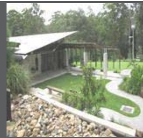
Maroochy Regional Botanic Gardens