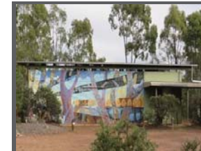
Myall Park Botanic Gardens Glenmorgan

The Friends currently activate ● Visitor & Guide services ● children's & adult education ● displays ● horticultural library ● science & research projects ● art plant botanic craft displays & sales ● Herbarium ● events & presentations. All in a small temporary structure.