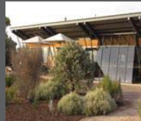
Aridland Botanic Gardens Port Augusta